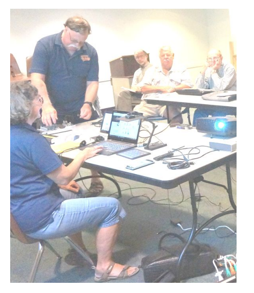
The Computer Geeks prepare for their talk in November, 2015.